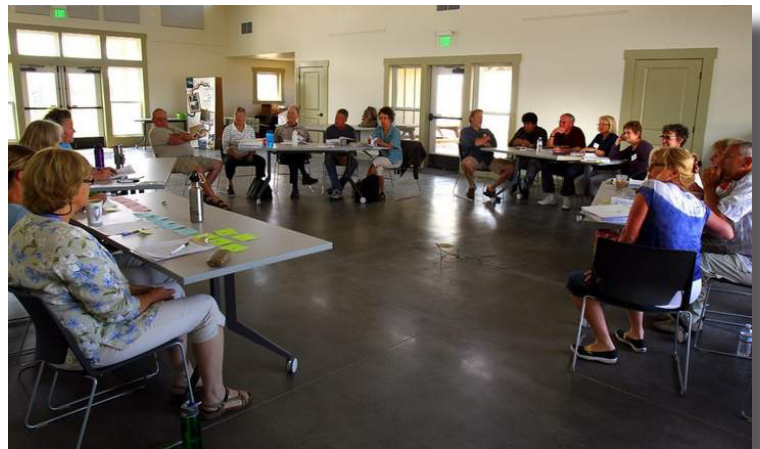
Docents taking their final exam at the end of the 50-hour training.